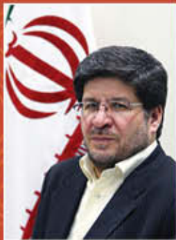
Hamid Safdel Vice Minister & president of Trade Promotion Organization of Iran

The successful experience of the world's leading countries in the economic sphere is the result of their strong focus on the export promotion and development of foreign trade. TPOs functions including; promotion, facilitation, information, and administration, provide support for the business community. The three core functions of trade policy, trade promotion, and trade facilitation will provide support to build productive capacities, upgrade industrial and agro-technologies, and expand exports and markets. In pursuit of those objectives and in view of the leading role of TPOs in preparing new policies and providing supporting facilities needed to develop a comprehensive infrastructure for the foreign trade, the Export Promotion Center of Iran (EPCI) with nearly four decades of hands-on experience in promoting the Non-Oil Export was restructured in 2004 and took up its new mandate as "Iran Trade Promotion Organization".