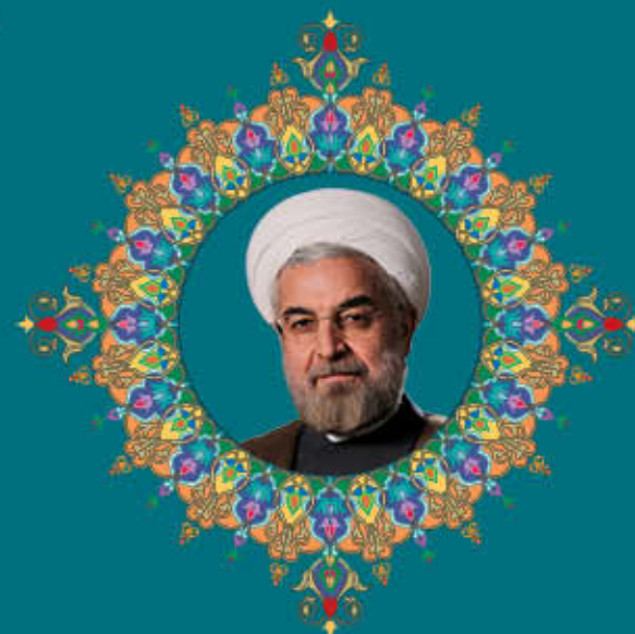
President Dr. Hassan Rohani