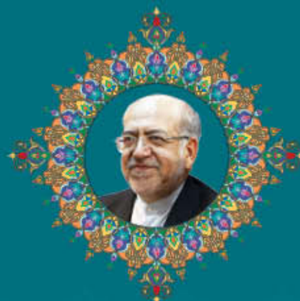
Minister of Industry, Mine & Trade Mohammad Reza Nemat Zadeh